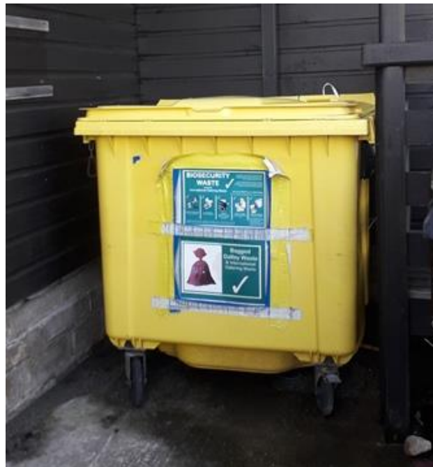
Figure 2: International Catering Waste bins are yellow and marked with an ICW sign.

For vessels or yachts at other moorings, ICW is to be sealed in the biohazard bags issued to you by Customs upon entry to the Falklands. Customs will collect the bags for safe disposal upon clearing your vessel to depart. Alternatively, ICW can be disposed of at the Department of Agriculture, in bins situated in the corner of the car park (a sign indicates the bin is for biosecurity material).